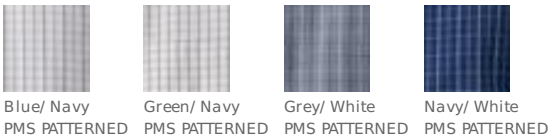
Blue/ Navy PMS PATTERNED Green/ Navy PMS PATTERNED Grey/ White PMS PATTERNED Navy/ White PMS PATTERNED